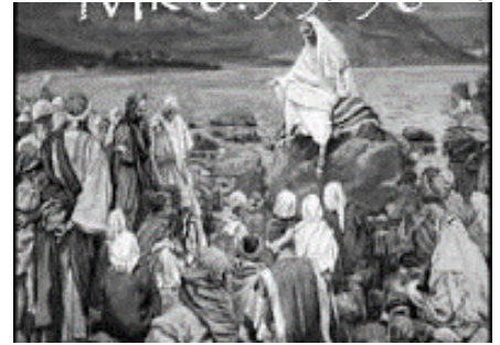
As many as touched were healed